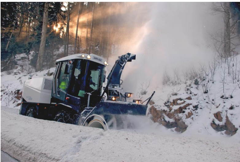
Captions: Supra 4002 and Supra 5002 in action

Aebi Schmidt is the leading system provider of innovative technical products for cleaning and clearing all traffic areas as well as mowing green spaces in particularly challenging terrain. The extensive range of products comprises our own vehicles as well as innovative attachments and demountable devices for individual vehicle equipment. A service programme perfectly tailored to sophisticated customer needs offers the appropriate solution to nearly any challenge. The close cooperation with municipal and private customers regularly results in well-regarded innovations which continually set new standards.